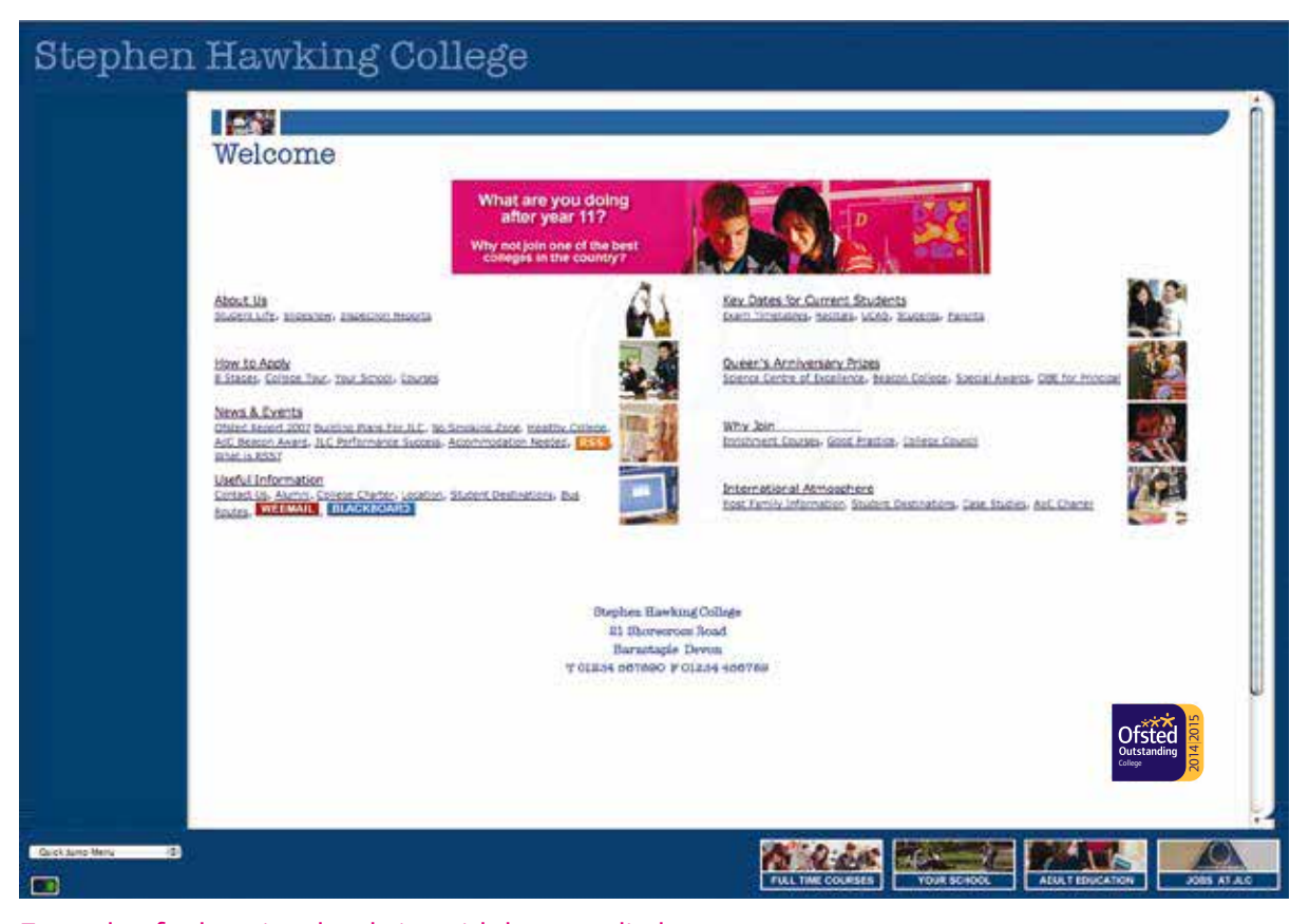
Example of educational website with logo applied