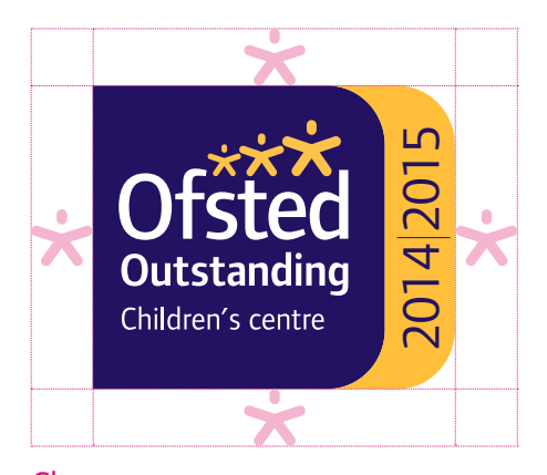
Clear space area