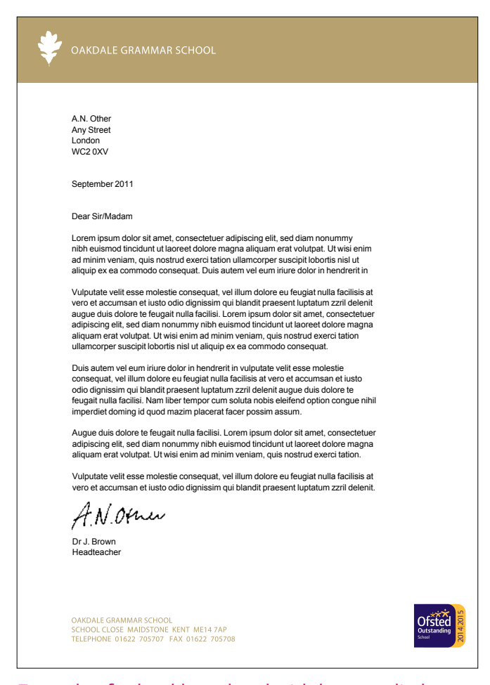
Example of school letterhead with logo applied

The Outstanding logo should be used no smaller than the minimum size of 20mm and should always adhere to the 'clear space rule' (refer to page 5 – Size and clear space).