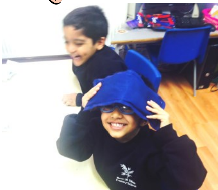
The Reception children are learning what the cold compress is used for.