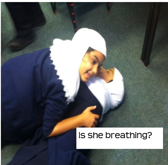
Is she breathing?