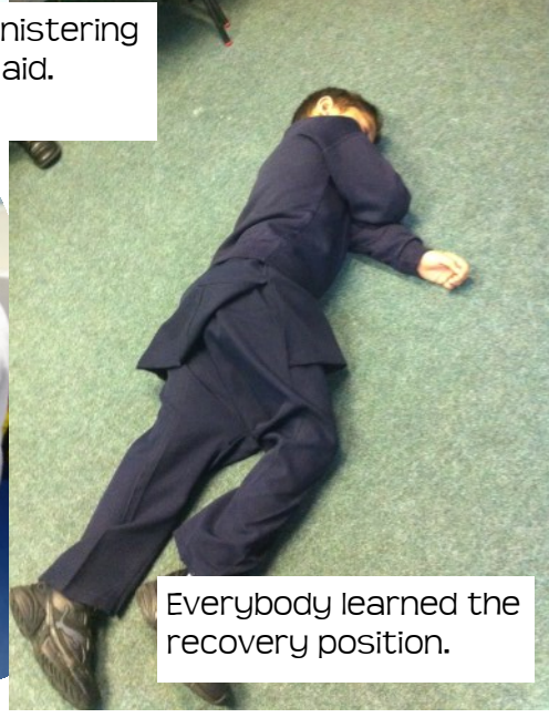
Everybody learned the recovery position.

S P L I N T B O R E S E W R S P R A I N B S K L E P D C Q X C V C J H Y L U I N K J R R B C X I L B U M P T A S L I N G I W E R Y T C W S T Q T N L K H C R Z X E C X V G N P H A S B R U I S E C I O P Z W E X D G F Y U J E S B E R N D H N C T