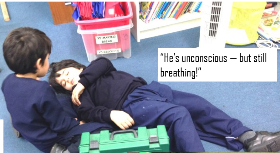
"He's unconscious — but still breathing!"