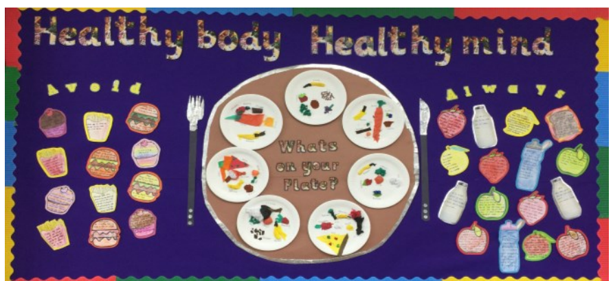
YEAR2 HALL DISPLAY ON HEALTHY