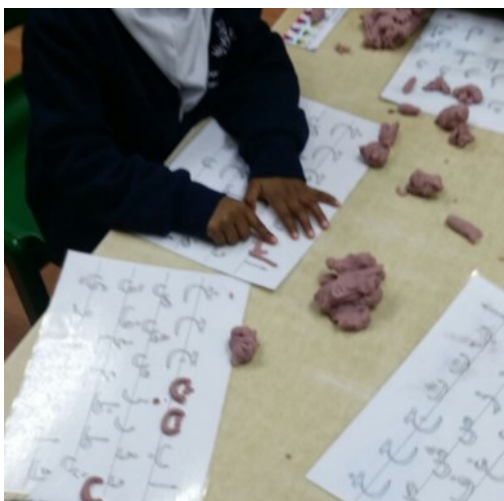
RECEPTION CLASS LEARNING THE ARABIC ALPHABETS by MOD-